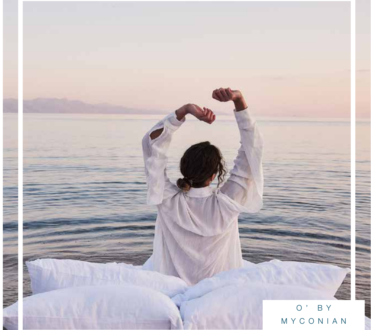
O' BY MYCONIAN COLLECTION