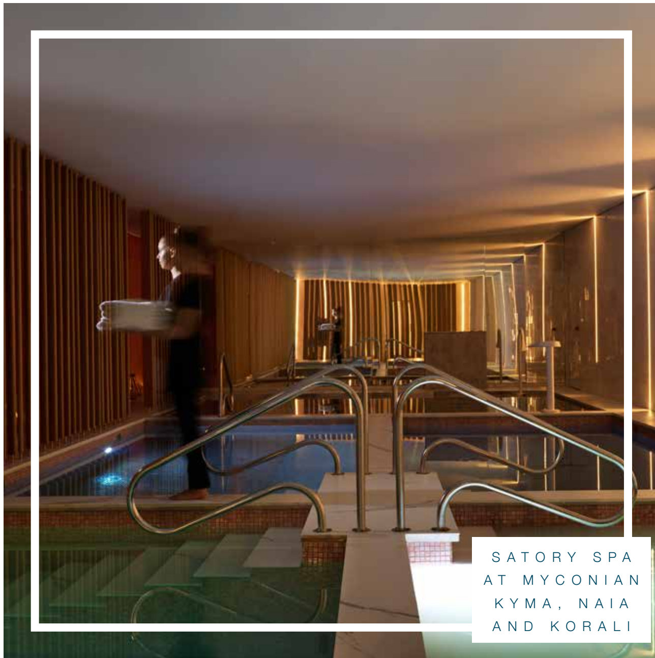
SATORY SPA AT MYCONIAN KYMA, NAIA AND KORALI